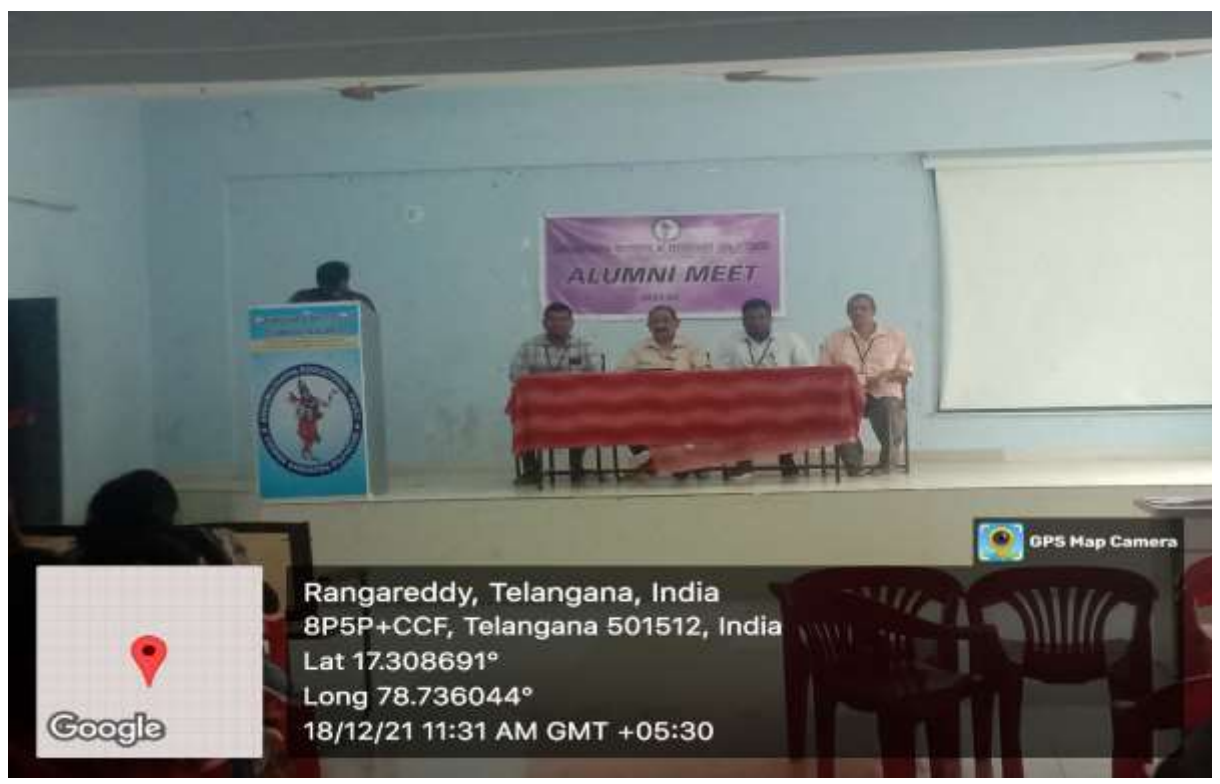
Alumni meet at AITH in the seminar hall

PRINCIPAL Annemectarys instructe of Technology & Sciences Plather (V), Batteringeren (Post) Abdullapurmer (TD, H.R. Clest. HVD-50* 555