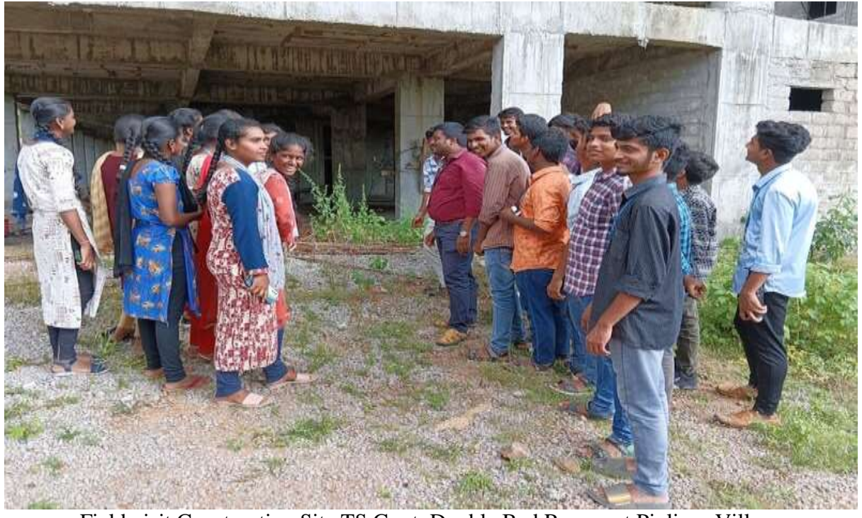
Field visit Construction Site TS Govt. Double Bed Rooms at Piglipur Village