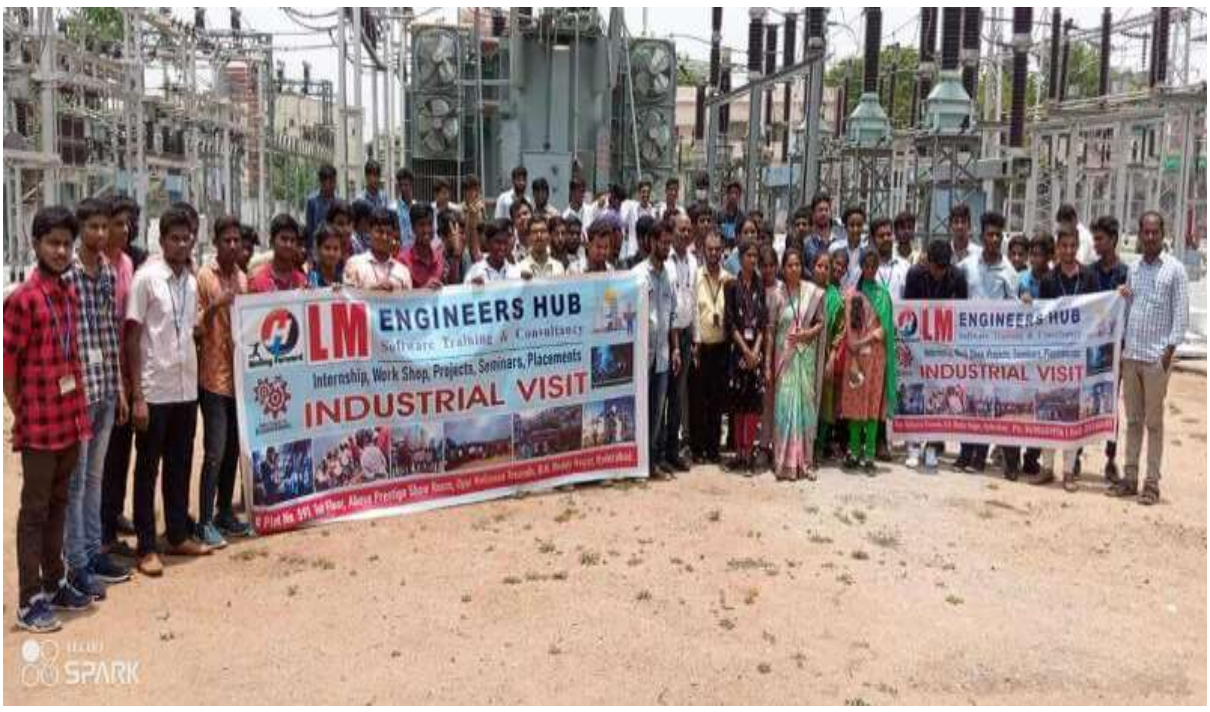
Industrial visit Sub-station at Ibrahimpatnam

\begin{array}{c} Piglipur(V),\,Batasingaram(Post),\,Adbullapurmet\,\,(M),\,R\,\,R\,\,Dist.,\,Hyderabad\,\,-\,\,501512\\ (Approved\,\,by\,\,A.I.C.T.E,\,Recognized\,\,by\,\,the\,\,Govt.\,\,of\,\,T.S.,\,Permanent\,\,Affiliation\,\,from\,\,JNTUH,\,Hyderabad) \end{array} Accredited by "NAAC with "B+" Grade, Recognized by UGC Under Section 2(f) and 12(B). Website: www. https://aits-hyd.org/, E-mail: principalaith@gmail.com, Contact No: 9848924705