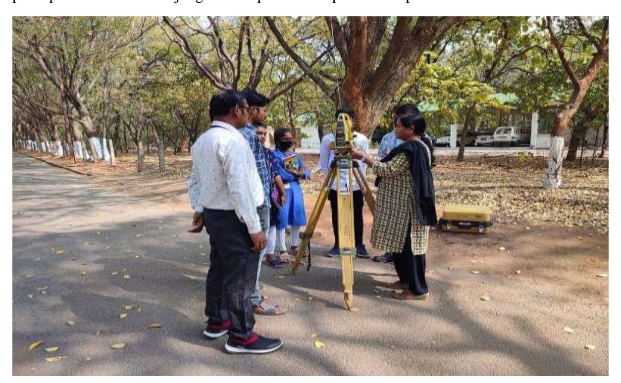
Field / Industrial visits: It provides combining knowledge of theoretical fundamental principles with skills and judgment acquired from practical experiences.

(Approved by A.I.C.T.E, Recognized by the Govt. of T.S., Permanent Affiliation from JNTUH, Hyderabad) Accredited by "NAAC with "B+" Grade, Recognized by UGC Under Section 2(f) and 12(B). Website: www. https://aits-hyd.org/, E-mail: principalaith@gmail.com, Contact No: 9848924705