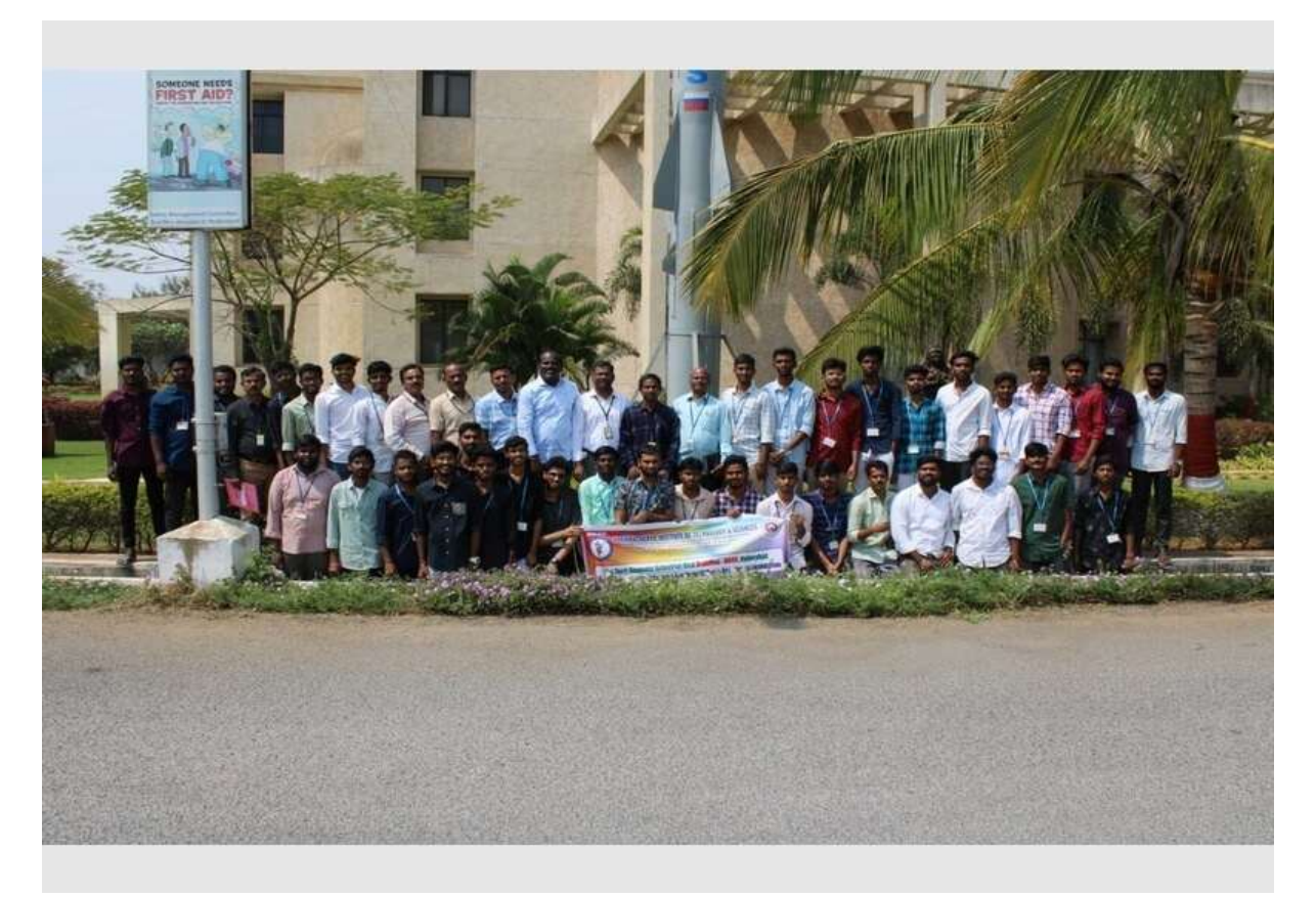
ECE students Field and Industry visit at BrahMos-DRDO, Hyderabad on 13th March 2023 in Association with Kalam's Institute of Youth Excellence Foundation

\begin{array}{c} Piglipur(V),\,Batasingaram(Post),\,Adbullapurmet\,\,(M),\,R\,\,R\,\,Dist.,\,Hyderabad\,\,-\,\,501512\\ (Approved\,\,by\,\,A.I.C.T.E,\,Recognized\,\,by\,\,the\,\,Govt.\,\,of\,\,T.S.,\,Permanent\,\,Affiliation\,\,from\,\,JNTUH,\,Hyderabad) \end{array} Accredited by "NAAC with "B+" Grade, Recognized by UGC Under Section 2(f) and 12(B). Website: www. https://aits-hyd.org/, E-mail: principalaith@gmail.com, Contact No: 9848924705