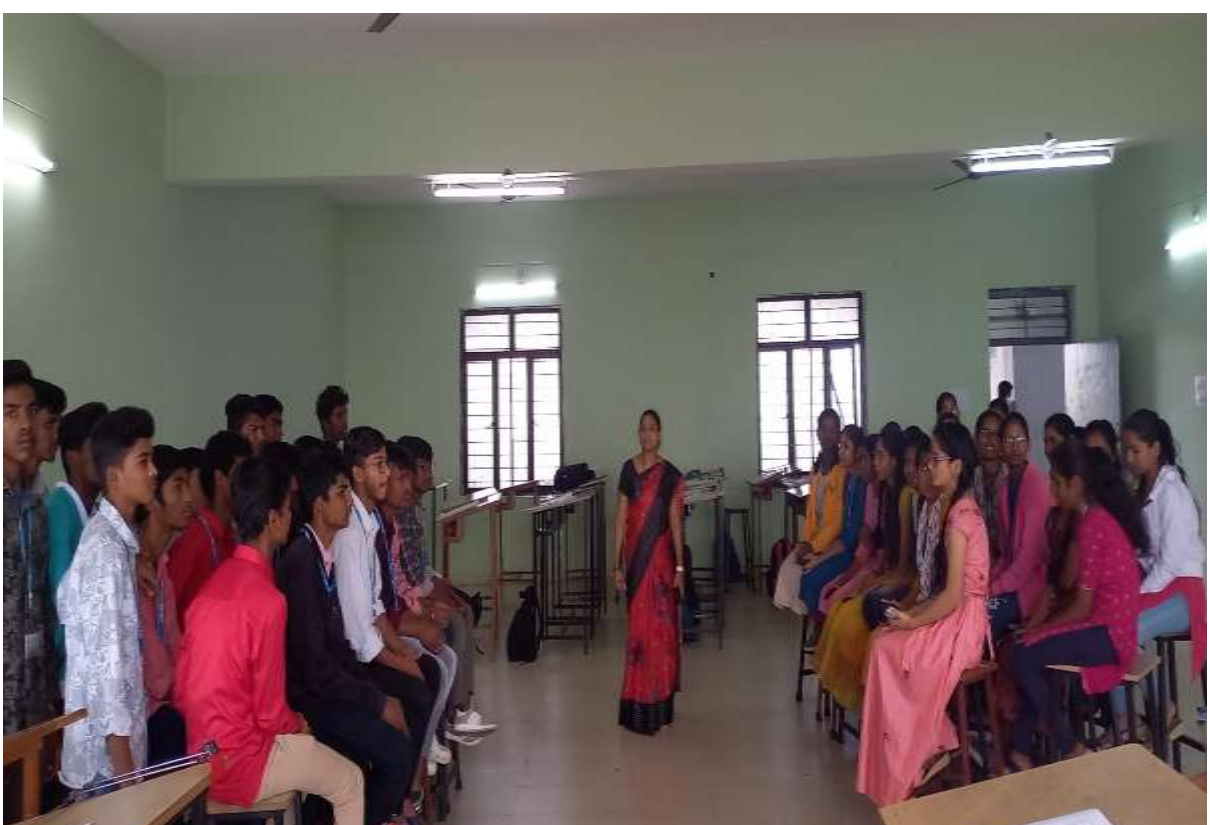
It Increases the power of establishing the self – argument in front of others.

Annamacharya Institute of Technology & Sciences Phylor (V), Balantageron (Post)