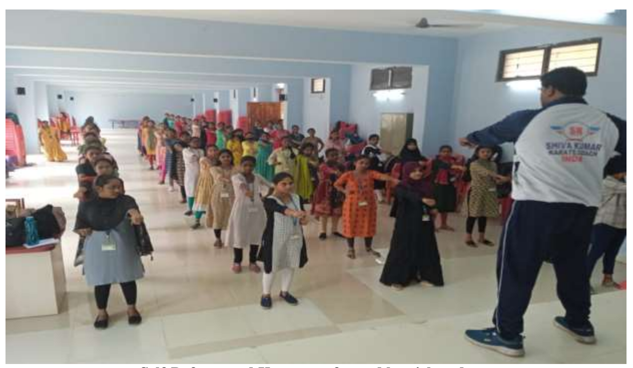
Self-Defense and Karate performed by girl students

(Approved by A.I.C.T.E, Recognized by the Govt. of T.S., Permanent Affiliation from JNTUH, Hyderabad) Accredited by "NAAC with "B+" Grade, Recognized by UGC Under Section 2(f) and 12(B). Website: www. https://aits-hyd.org/, E-mail: principalaith@gmail.com, Contact No: 9848924705