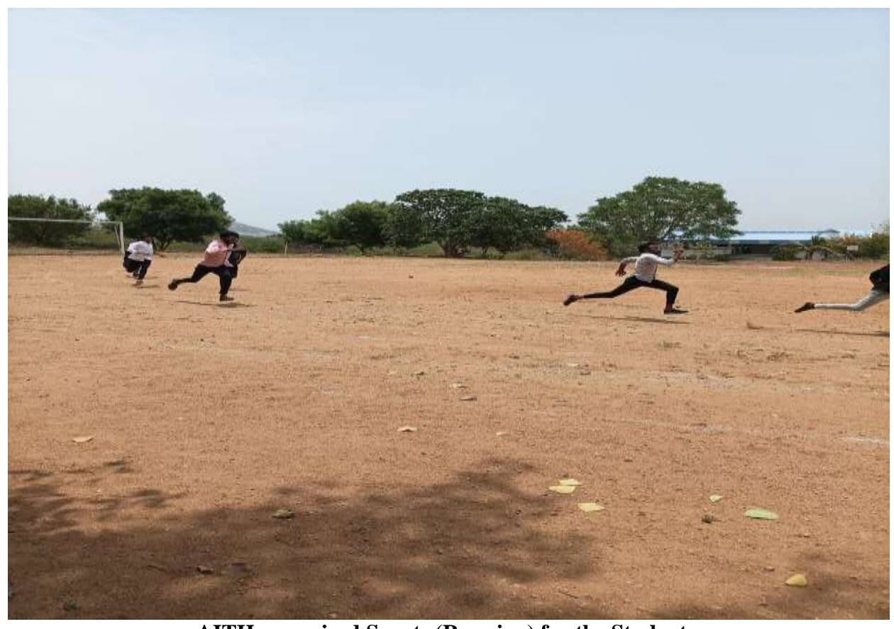
AITH organized Sports (Running) for the Students.

PRINCIPAL Annamecharys Institute or Technology & Sciences Pighour (V), Balusingsrem (Post) Publisherment (70, H. R. Dist. 1470-50*)