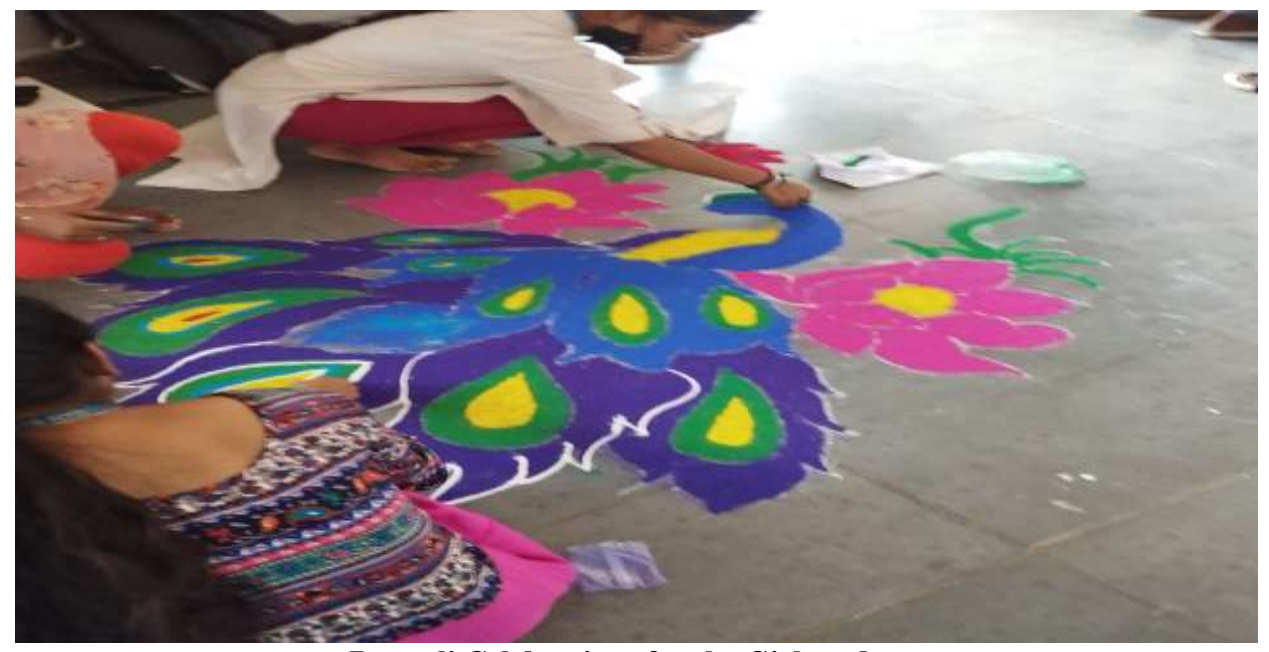
Rangoli Celebrations for the Girl students

Keeping in view to students' appetite for activities apart from academics, we keep them occupied with various extra-curricular cultural Activities like Rangoli Competitions. Rangoli Competitions are organized in the institution to enhance creativity and unleash the hidden potential of the students. Students made Rangolis and presented beautiful designs.