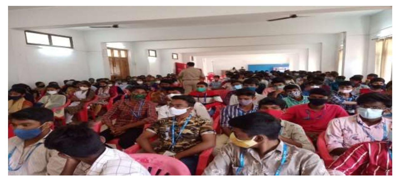
She Team S.I addressed the girl and Boys students to mould themselves in all aspects of their life.

Annamecharya Institute of Technology & Sciences Flighpur (V), Balandegeren (Post)