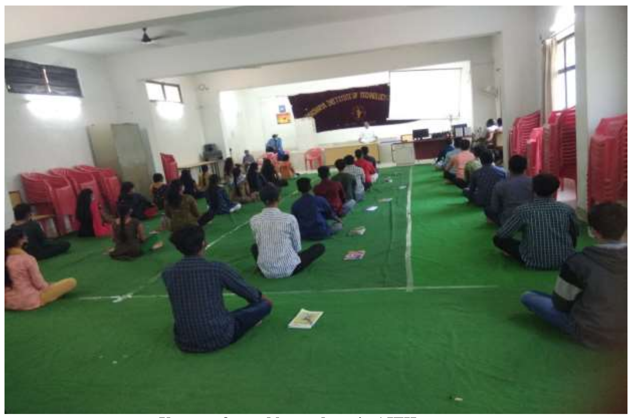
Yoga performed by students in AITH campus

(Approved by A.I.C.T.E, Recognized by the Govt. of T.S., Permanent Affiliation from JNTUH, Hyderabad) Accredited by "NAAC with "B+" Grade, Recognized by UGC Under Section 2(f) and 12(B). Website: www. https://aits-hyd.org/, E-mail: principalaith@gmail.com, Contact No: 9848924705