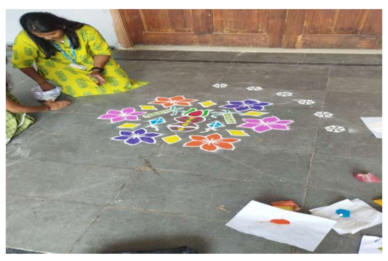
Rangoli Celebrations for the Girl students

Website: www. https://aits-hyd.org/, E-mail: principalaith@gmail.com, Contact No: 9848924705