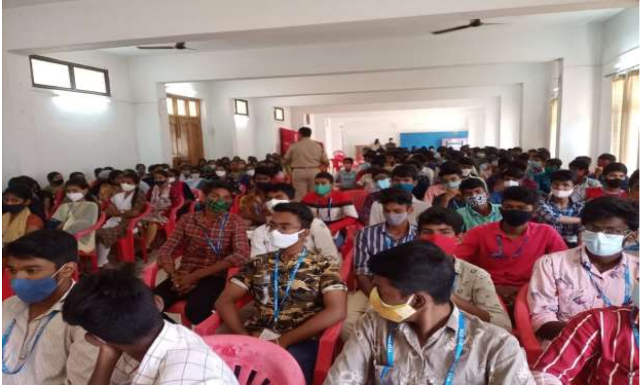
Anti-Drug Awareness program conducted on 10th October' 2022 at AITH.

Anti-Drug Awareness program by Govt. of Telangana