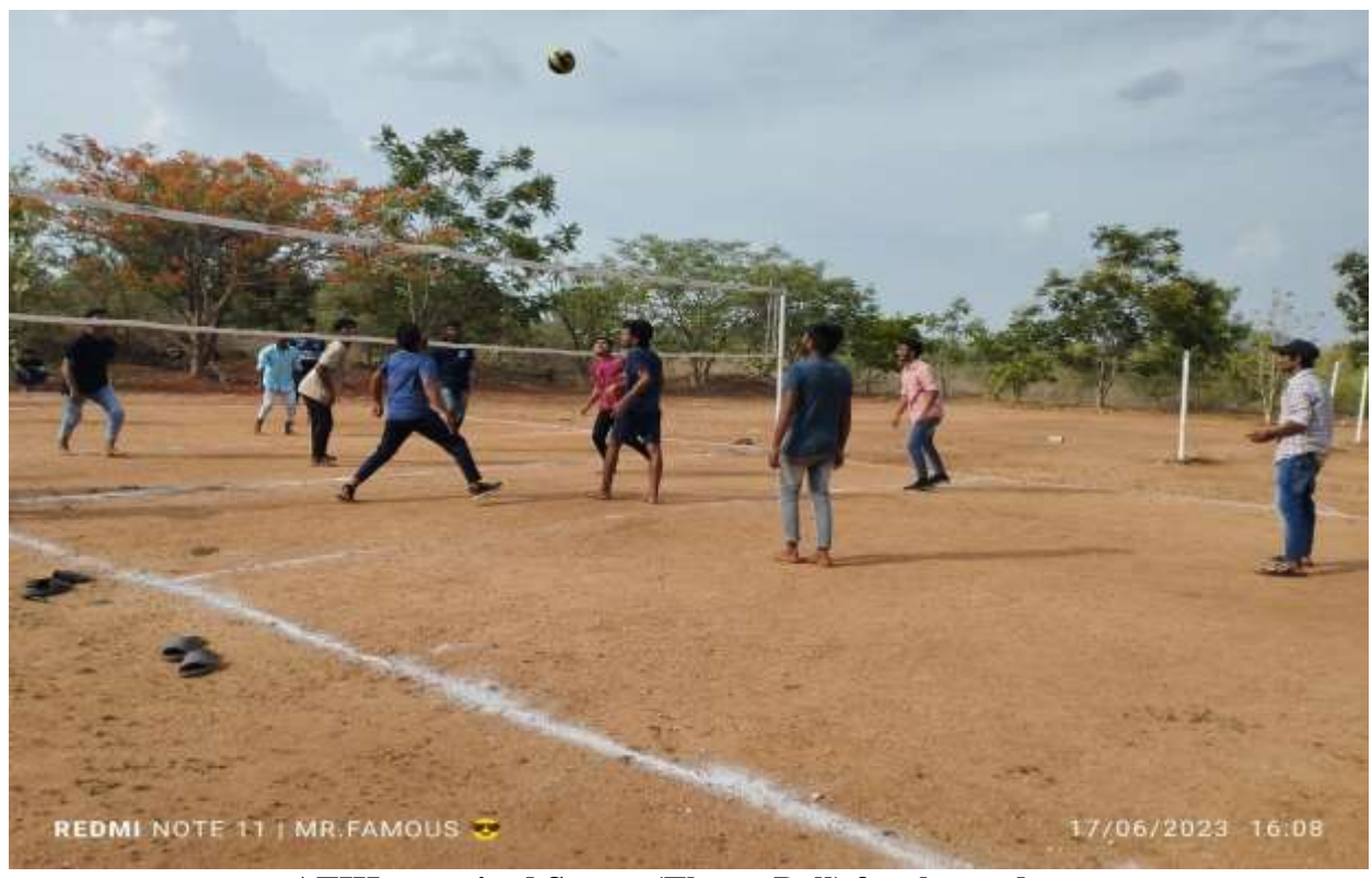
ATIH organized Sports (Throw Ball) for the students

PRINCIPAL Annamectarys Insulute of Technology & Sciences Philogophy (V), Balandegeron (Post)