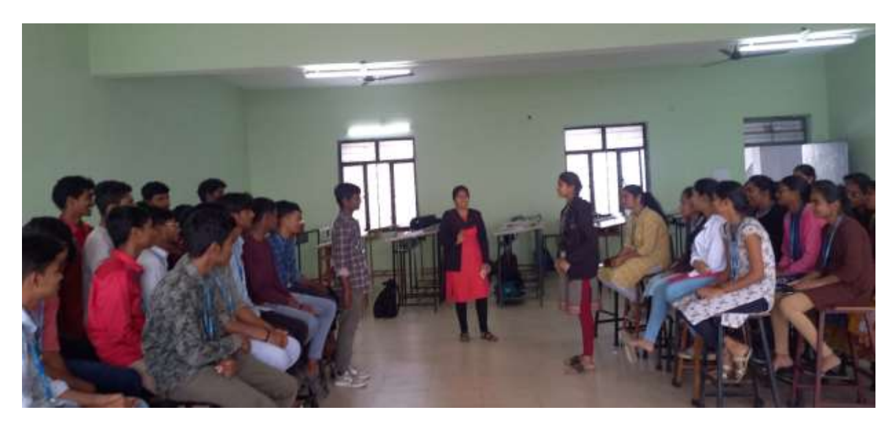
DEBATE ON GENDER EQUUITY (Gender equity is the process of being fair to women and men).

Project/Assignment: 30% End Term Exam: 50%