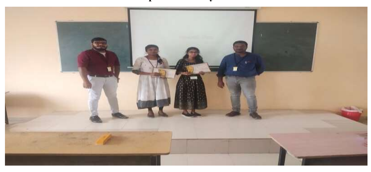
AITH Organized seminars and awarded prizes for the students.

PRINCIPAL Annamecharys Institute of Technology & Sciences Pighpur (V), Babasingeren (Post) Abdullanderen (Post)