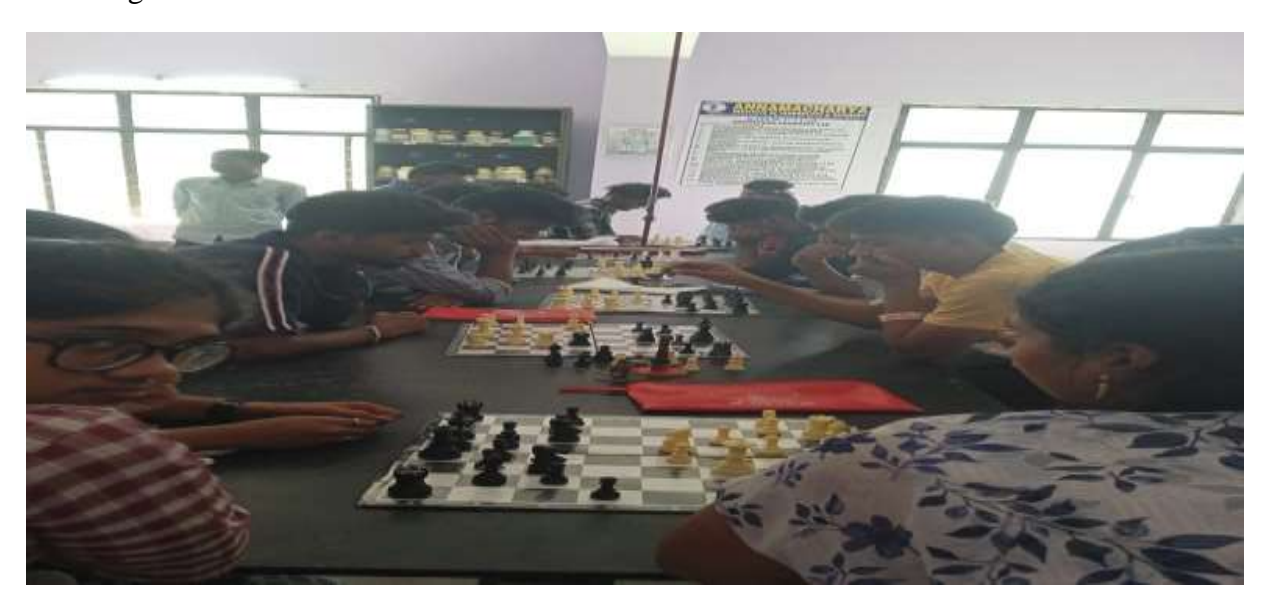
Sports Day Celebrations at AITH

Sport has the power to change lives. The ability to drive gender equality by teaching women and girls teamwork, self-reliance, resilience and confidence. Women in sport defy gender stereotypes and social norms, make inspiring role models, and show men and women as equals. Helps maintain healthy bones, muscles, and joints. Helps control weight, build lean muscle, and reduce body fat. AITH sports club play a significant role in helping the girl students improve their sports and physical fitness. AITH conducting common sports remove the barrier between gender.