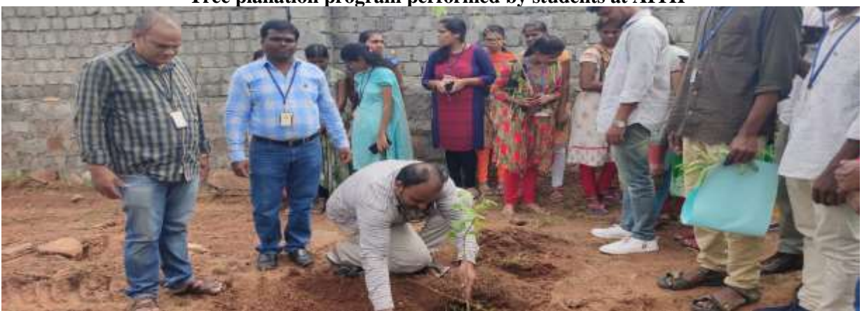
Tree planation done by Staff at AITH