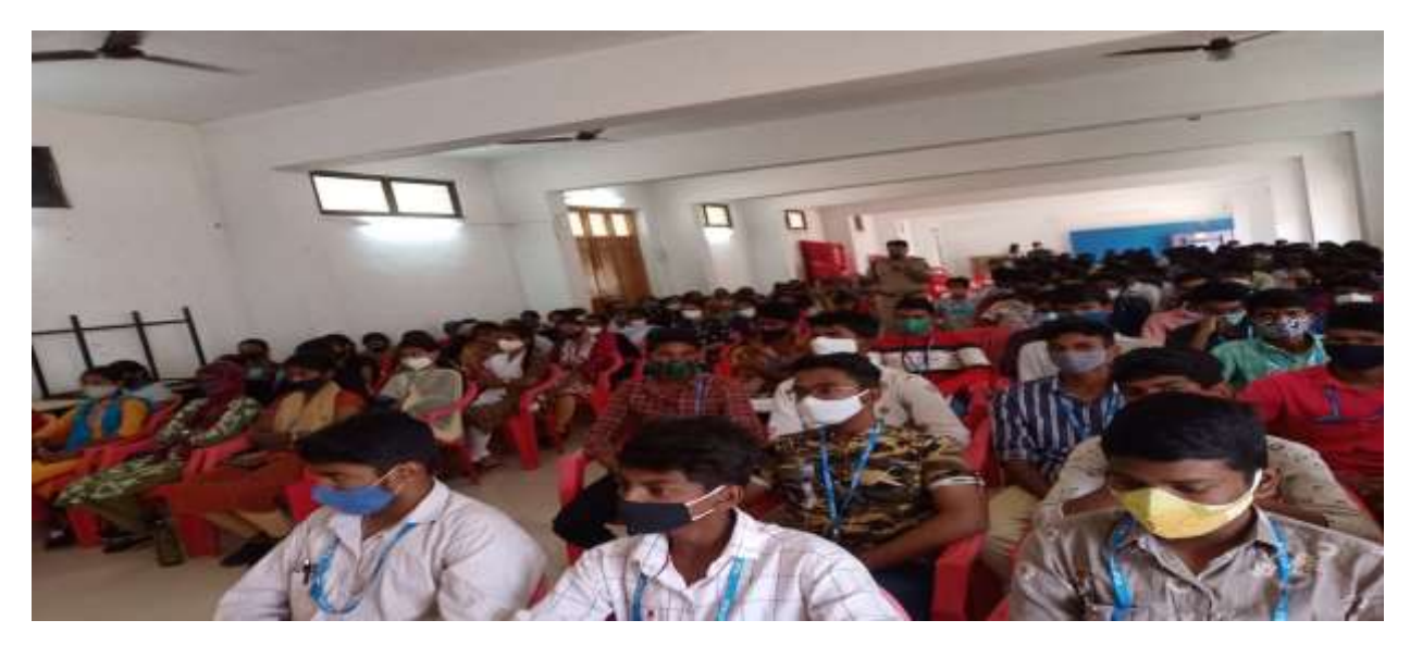
She Team organized at AITH (She Team) members addressed the gathering for girls and Boys students.

SHE Teams is a division of Telangana Police for enhanced safety and security of women. They also work to prevent child marriages in Telangana State. The teams work in small groups to arrest eve teasers, stalkers and harassers. AITH invited she team personals and conducted awareness program about women safety.