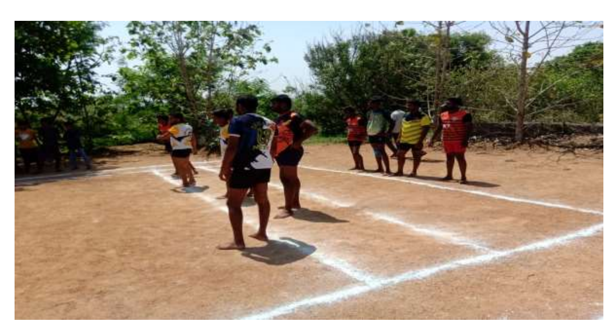
AITH Organized Sports (Kabadi) for the faculty.

(Approved by A.I.C.T.E, Recognized by the Govt. of T.S., Permanent Affiliation from JNTUH, Hyderabad) Accredited by "NAAC with "B+" Grade, Recognized by UGC Under Section 2(f) and 12(B). Website: www. https://aits-hyd.org/, E-mail: principalaith@gmail.com, Contact No: 9848924705