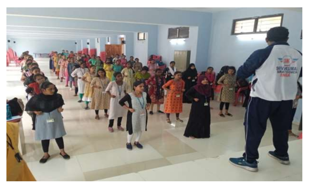
Karate practice performed by girl students

(Approved by A.I.C.T.E, Recognized by the Govt. of T.S., Permanent Affiliation from JNTUH, Hyderabad) Accredited by "NAAC with "B+" Grade, Recognized by UGC Under Section 2(f) and 12(B). Website: www. https://aits-hyd.org/, E-mail: principalaith@gmail.com, Contact No: 9848924705