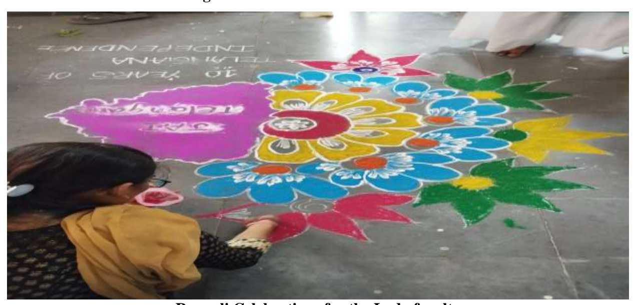
Rangoli Celebrations for the Lady faculty