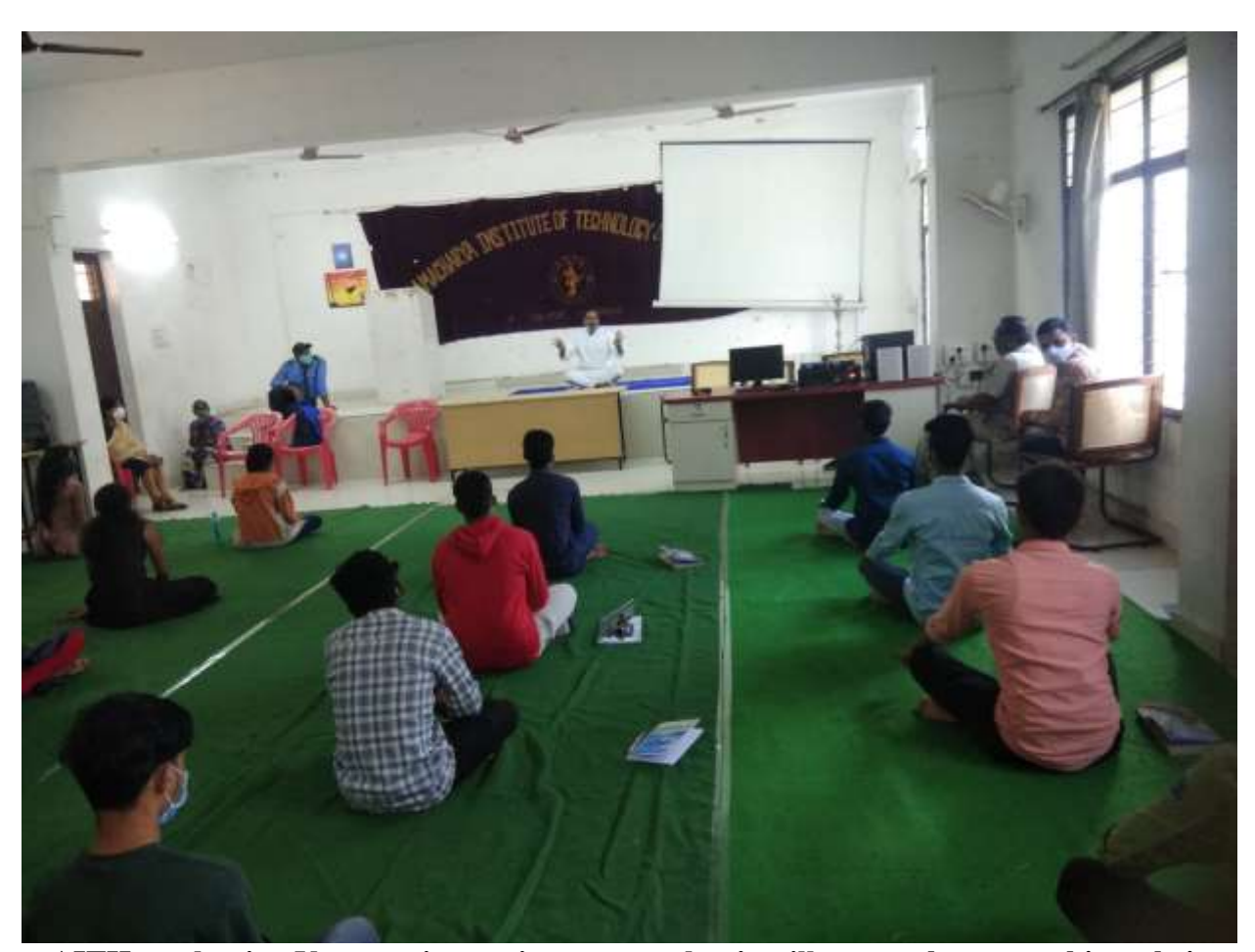
AITH conducting Yoga sessions to improve student's will-power they can achieve their goals easily.

Yoga is a mind and body practice. Various styles of yoga combine physical postures, breathing techniques, and meditation or relaxation. Yoga is an ancient practice that involves physical poses, concentration, and deep breathing. Yoga offers flexibility to the body and relaxation to the mind. There are different asanas practised by people, and each asana has its benefits on the mind and body. Yoga is designed to sharpen our minds and to improve our intelligence. Regular practice of yoga can help in controlling our emotions and promote well-being.