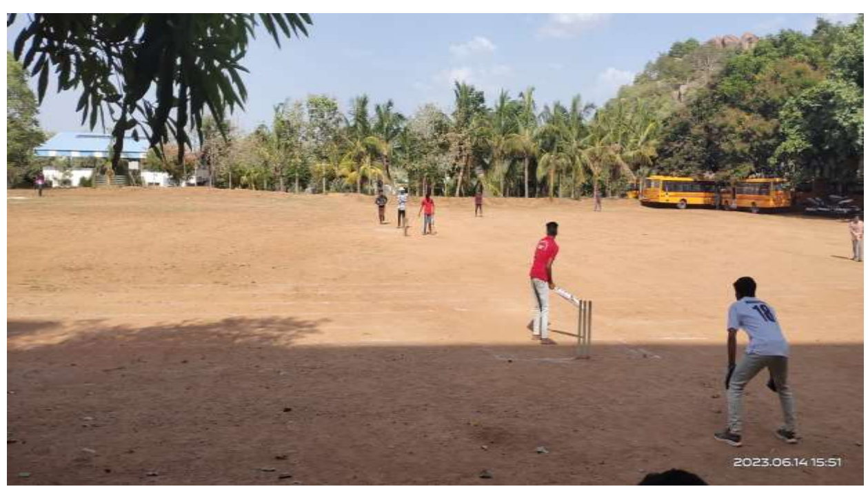
AITH conducted Sports for the faculty and Students

Website: www. https://aits-hyd.org/, E-mail: principalaith@gmail.com, Contact No: 9848924705