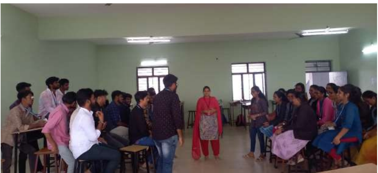
DEBATE ON GENDER EQUUITY (Gender equity is the process of being fair to women and men).

PRINCIPAL Annemediarys Insulute of Technology & Sciences Pighour (V), Estandarderen (Post) Abhiliparent (D), R. Dist. NYO-501