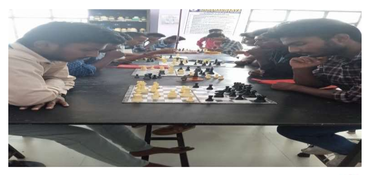
Sports Day Celebrations at AITH