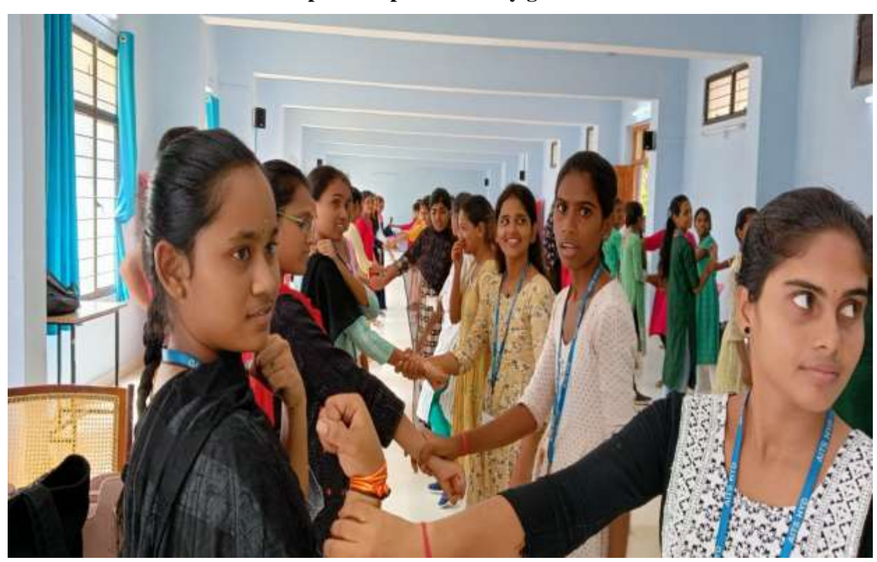
Self-Defense and Karate performed by girl students