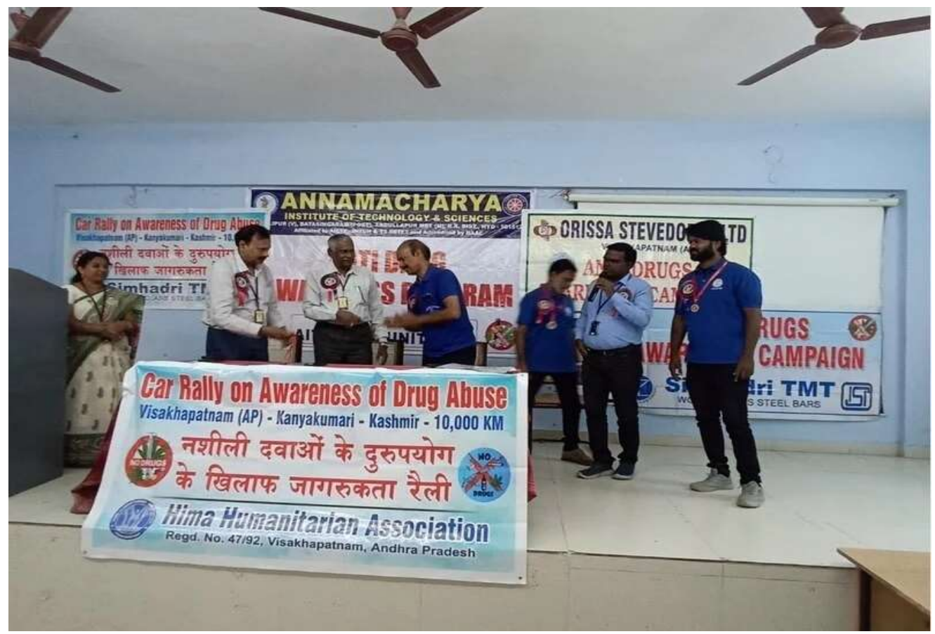
Anti-Drug Awareness program conducted on 14th December' 2023 at AITH.

PRINCIPAL Annumacharya Insulate or Technology & Sciences Papipar (V), Belessingeren (Post) Abdullarennas (M), R & Blac HYD-50* 585