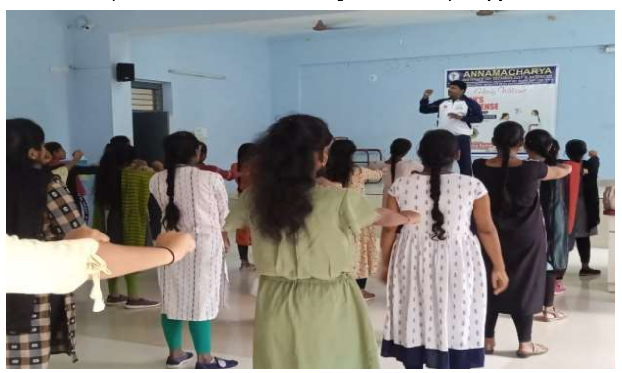
Self-Defense and Karate training program to train girl students for self-defense organized at AITH.

To attain and empower the students AITH conducting Karate workshop every year.