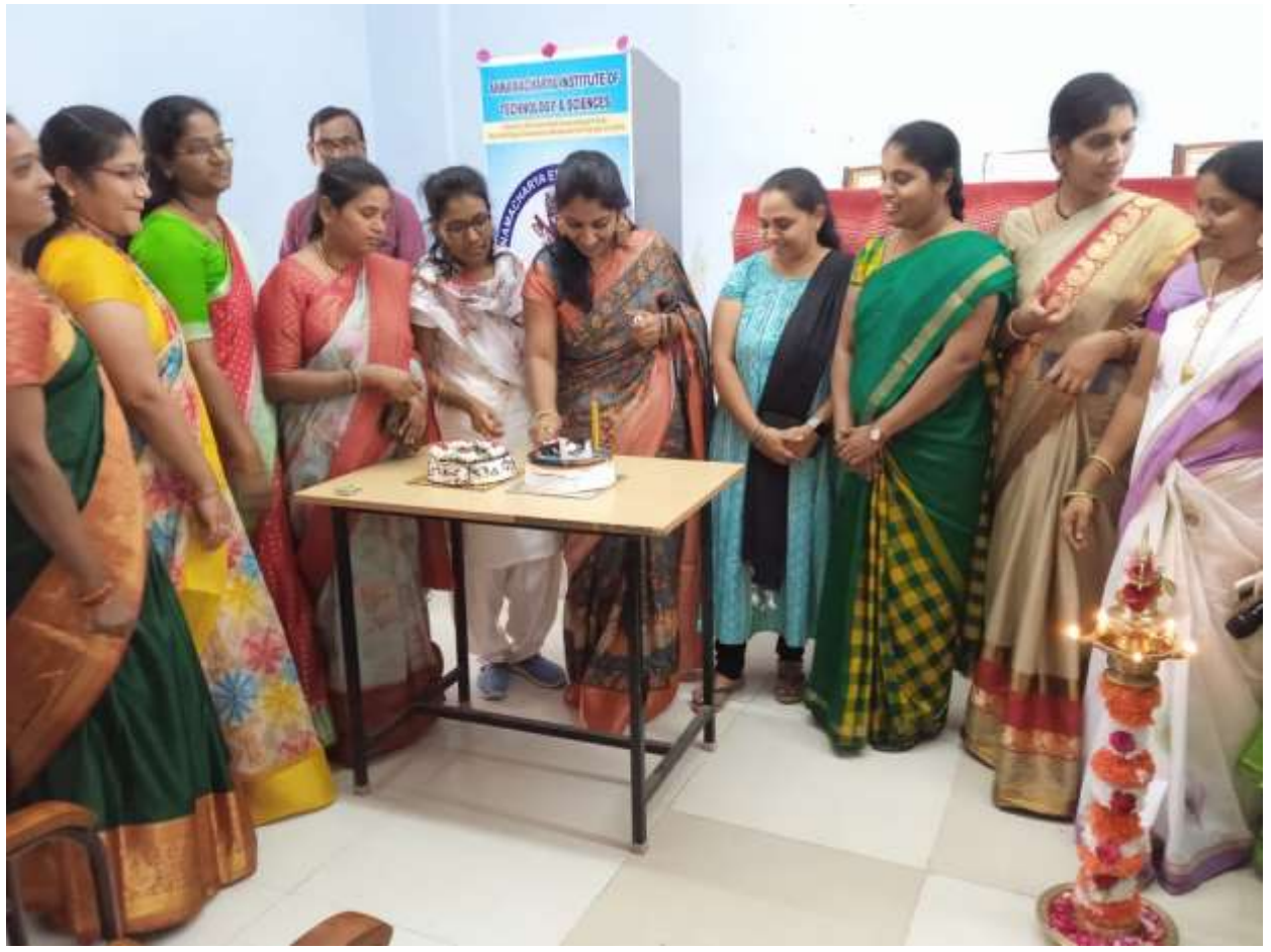
Women's Day Celebration on 08/03/2022 with Management, Staff at AITH

(Approved by A.I.C.T.E, Recognized by the Govt. of T.S., Permanent Affiliation from JNTUH, Hyderabad) Accredited by "NAAC with "B+" Grade, Recognized by UGC Under Section 2(f) and 12(B). Website: www. https://aits-hyd.org/, E-mail: principalaith@gmail.com, Contact No: 9848924705