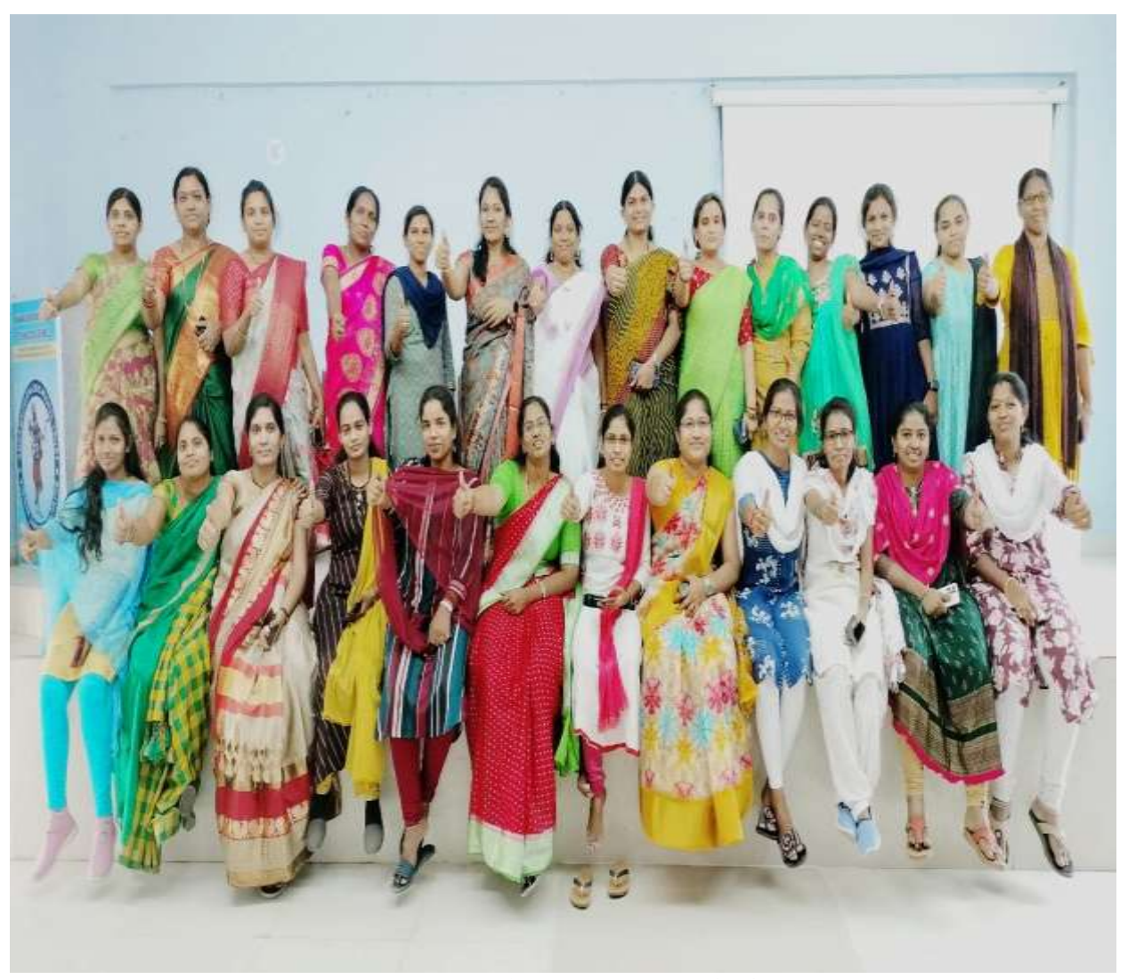
Women's Day Celebration on 08/03/2022

International Women's Day is an occasion to celebrate the progress made towards achieving gender equality and women's empowerment but also to critically reflect on those accomplishments and strive for a greater momentum towards gender equality worldwide. AITH celebrates International Women's Day to empower women with motivational talk on selfconfidence, decision making and their rights in all aspects.